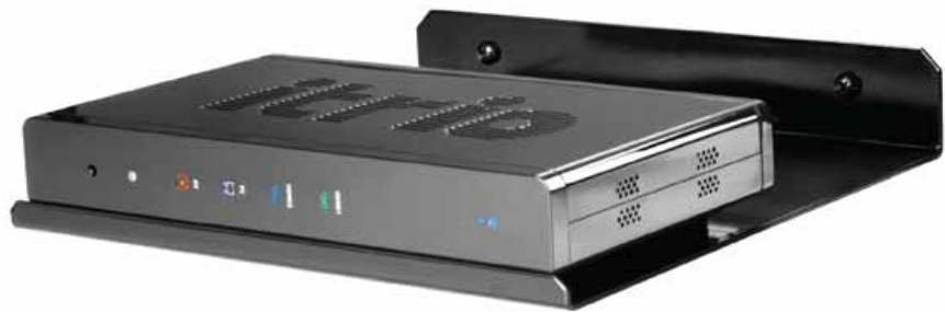
HD Flow Wall Shelf (HDS-5) shown with HD Flow Wireless Multimedia and (HDS-100), sold separately.

Versatile. Ventilating. Very Cool Looking.